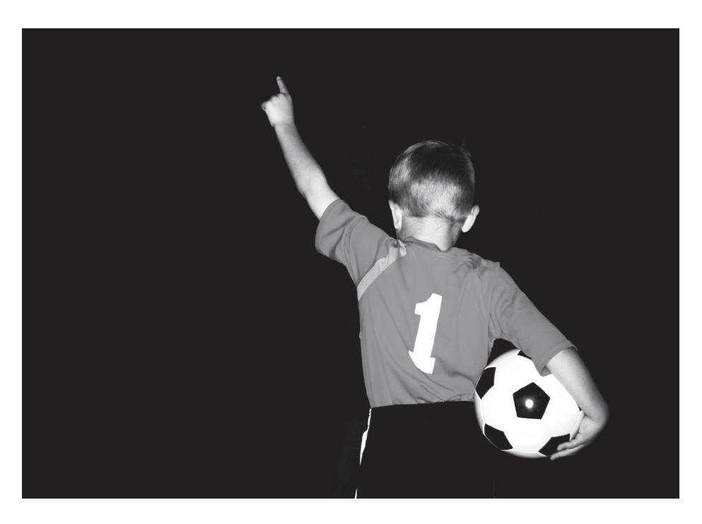
Big Ideas continued from page 12

In the real world, no teacher is there to direct and remind you about which lesson to plug in here or what strategy fits there; transfer is about intelligently and effectively drawing from your repertoire, independently, to handle new situations on your own.